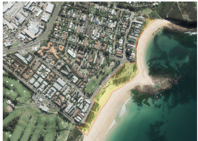
Figure 2 The subject site is highlighted in yellow and bounded in red.